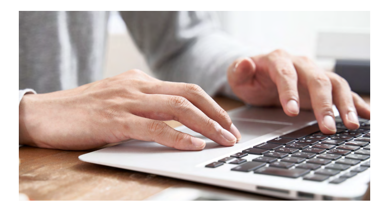
What happens if the AdviceLine session takes less time or lasts longer than scheduled?

AdviceLine hours expire one year from date of sale.