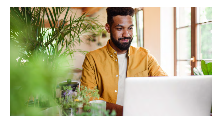
What happens if my AdviceLine session runs over the scheduled time?

AdviceLine sessions are scheduled and accounted in one-hour blocks. For example, a session scheduled for two hours but taking one and one-half hours would be billed at two hours. A session scheduled for three hours but only took one and one-half hours would be billed at two hours.