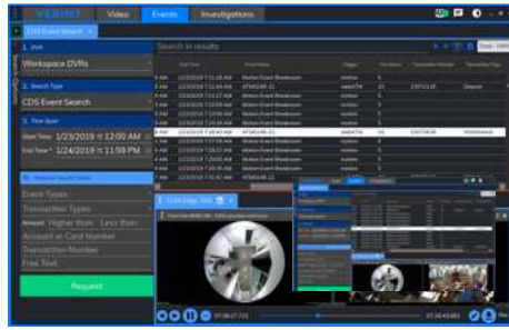
Verint Video Investigator™ (VVI)