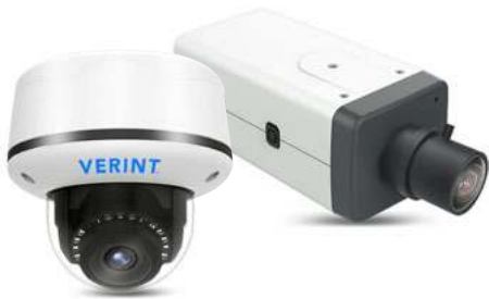
V8080BX-DN / FDW-DN